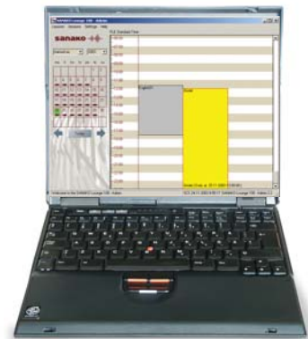
SANAKO Forum 100 Admin Software

For more information, please contact your local Sanako distributor.