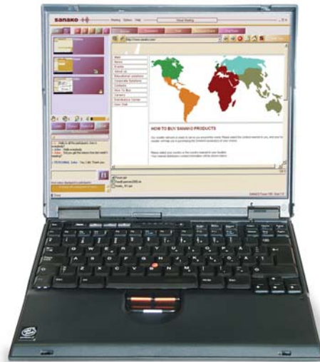
SANAKO Forum 100 trainer's software

SANAKO Forum 100 allows a trainer to host a training session from anywhere and session members to participate from wherever they are. Even for the most remotely located participants, the trainer is always at hand for assistance and instruction. The advanced Voice over Internet Protocol (VoIP) technology in SANAKO Forum 100 offers voice communication for human interaction as well as progress and performance support in a virtual, online environment.