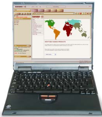
SANAKO Forum 100 participant's software